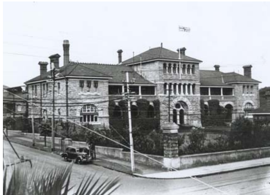
The Perth Mint in 1936

While a visit to The Perth Mint is educational, cultural and historical, its wealth of unique displays enable people to bask in the pleasure of being surrounded by the most alluring natural treasure known to man – gold! At the heart of the State's gold industry since 1899, The Perth Mint remains an invaluable resource providing insight into the tremendous impact the discovery of gold had on shaping Western Australia.