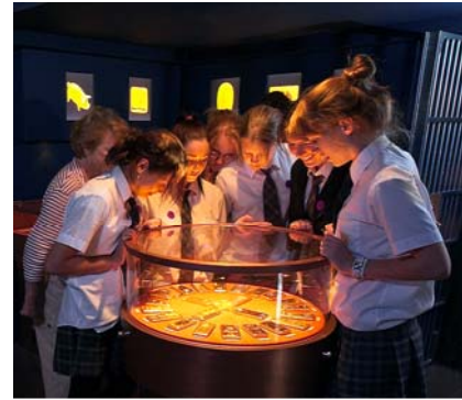
School children admiring pure gold bars in the International Gold Bar Exhibition