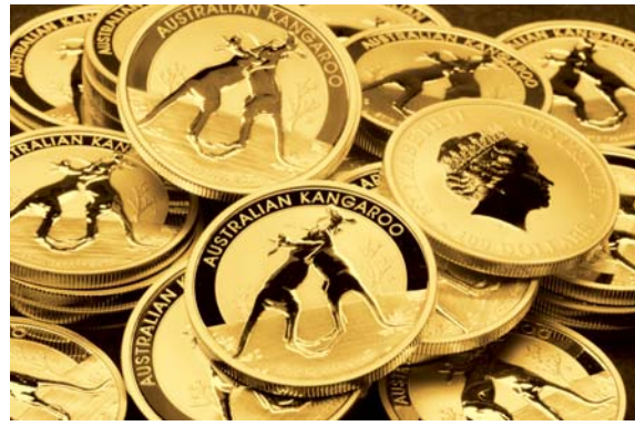
Pure gold Australian Kangaroo coins