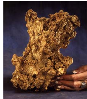
Newmont Mining's Normandy Nugget