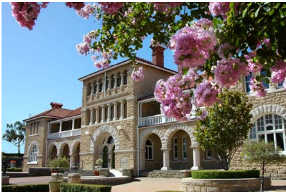
The Perth Mint building today

Since the early 1990s, it has also established itself as a multi-award winning tourist attraction, welcoming more than 80,000 visitors to its heritage site each year. The Perth Mint is today one of the State's premier destinations and one of the city's most meticulously maintained architectural landmarks. Winning more than 11 tourism awards in seven years, including the coveted Sir David Brand Award for Tourism three times, for its contribution to the State's tourism industry, the Mint offers a unique visitor experience duplicated no where else in the world.